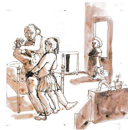
Paula Rego, Study for Family Series, n.d., Private Collection